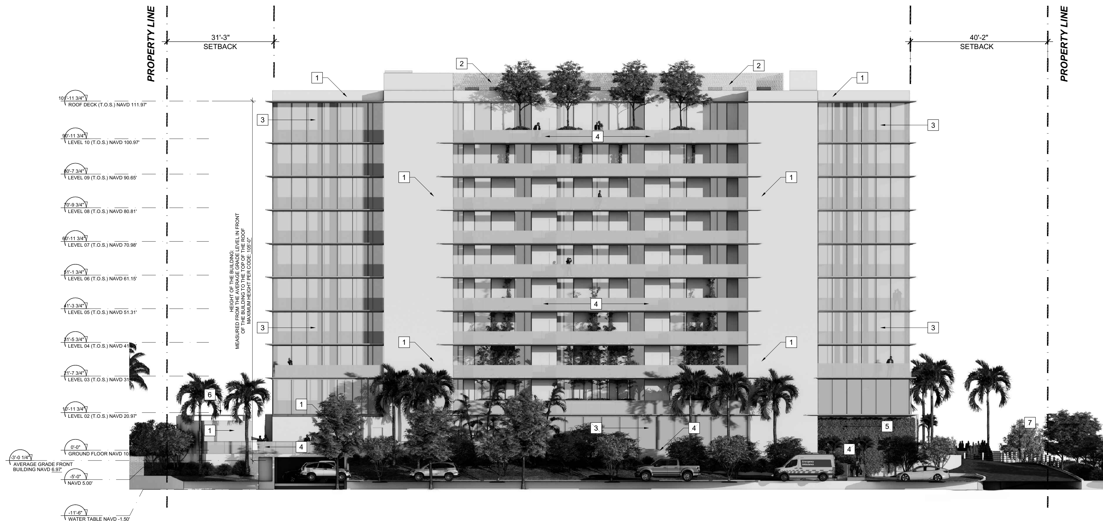
1B FRONT ELEVATION (EAST) - AFTER A-501 SCALE:1/16" = 1'-0"