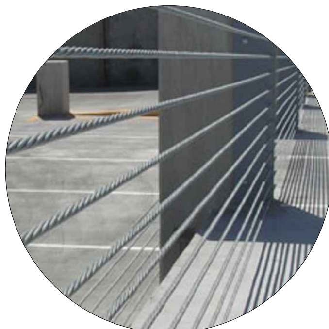
7 42" H. CABLE CRASH WALL (HORIZONTAL WIRES) SHOP DRAWINGS TO BE APPROVED PRIOR TO INSTALLATION

Digitally signed by Stephane L'Ecuver Date: 2024.06.11 10:10:24-0400'