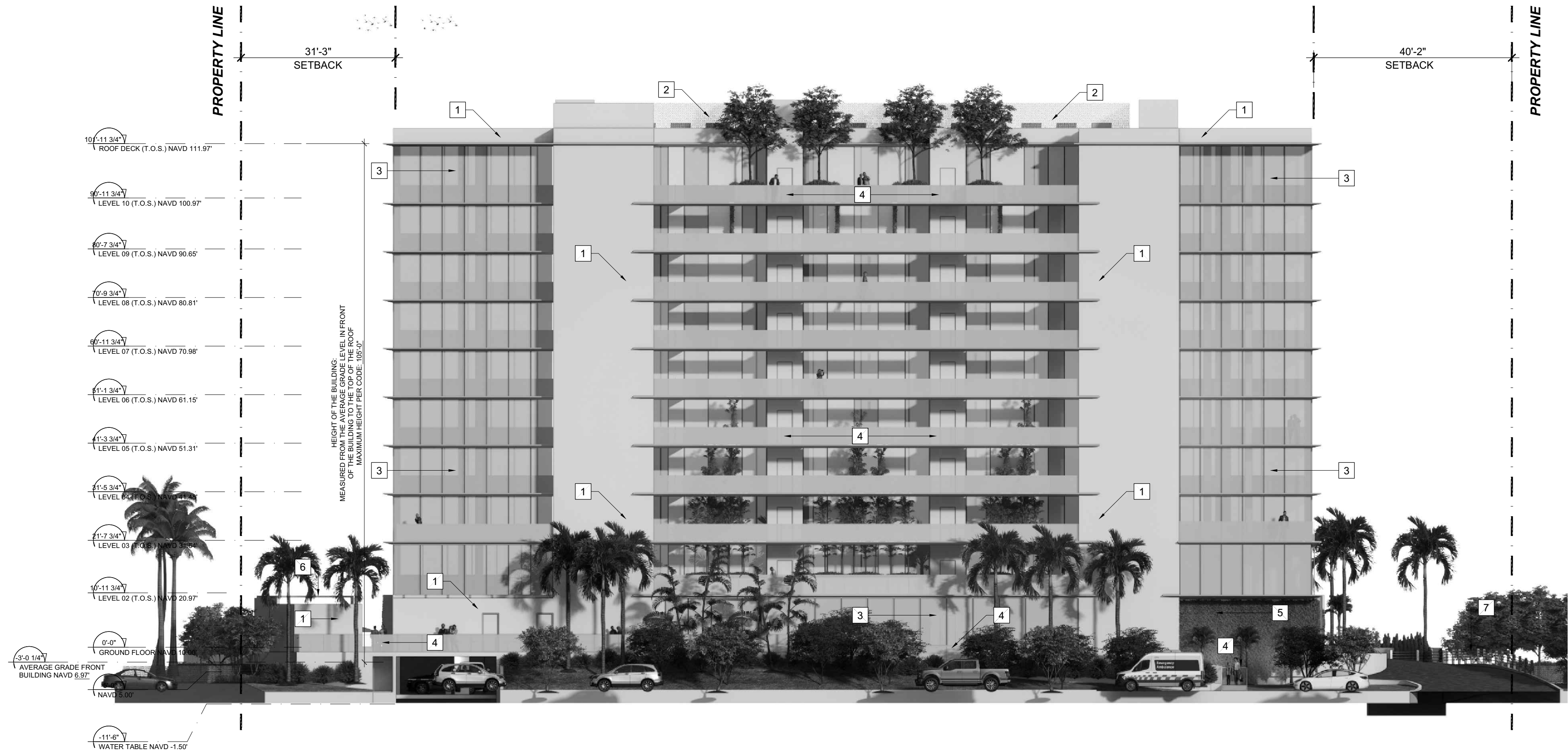
1A FRONT ELEVATION (EAST) - BEFORE A-501 SCALE:1/16" = 1'-0"