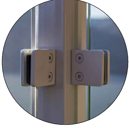
4 FRAMELESS CLEAR GLASS RAILING SYSTEM